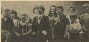
The Young People's Theater Kids at dress rehearsal for their Christmas Pageant.

A crane was used to help the men decorate the tree with 14,000 lights, over 1/2 mile of garland, 1,000 colored balls (each as big as a basketball), 200 red bows, 200 3-foot candy canes (not real candy) and 100 snow flakes (not real either). The silver star at the top is 6 feet high.