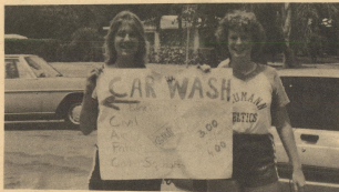
They do a nice job of pulling in customers right off the street...

The Civil Air Patrol Cadets held a car wash on Saturday, May 22. They found it a good way to make money and keep cool at the same time - not an easy thing to do these days.