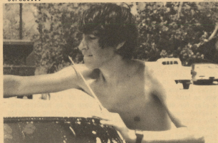
Another Mercedes? I'd rather wash the compact cars!