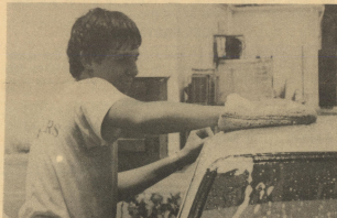
Is he wet from the sweat of hard work, or is someone a little careless with the hose? Who cares, it's cool.