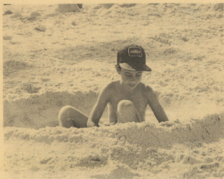
A Kid that really gets into his work at the Sand Castle Building Contest in September.