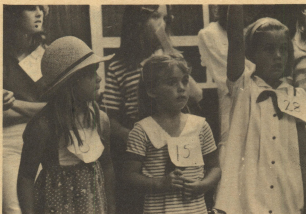
All the kids were talented at "Sound of Music" try-outs.

d s b c d v u n i l h p d a a e v i o o c c c s i e t o b a a n n b e b p t t u g n i m m i w s b p q p s o h u o g a a e n c m a h z r e b a m r l w b k e e e d n a a b d b r