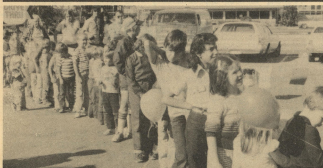
A crowd of his admirers line up for an audience with the King.

FOR SALE - SCHWINN 10 speed, needs new chain. Call 774-7772.