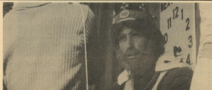
The Burger King had a magic show when he appeared at the East Trail Burger King on December 12.