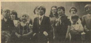
The Young People's Theater Kids at dress rehearsal for their Christmas Pageant.

A crane was used to help the men decorate the tree with 14,000 lights, over 1/2 mile of garland, 1,000 colored balls (each as big as a basketball), 200 red bows, 200 3-foot candy canes (not real candy) and 100 snow flakes (not real either). The silver star at the top is 6 feet high.