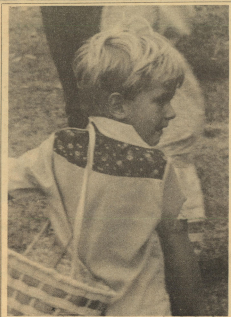
The real pro's keep both hands free when searching out the elusive Easter egg.