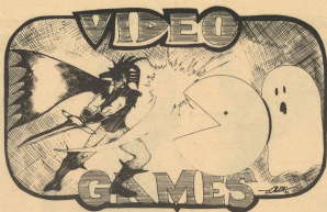
Artwork by Kevin Owen

WANTED - Baseball trading cards. 261-8906