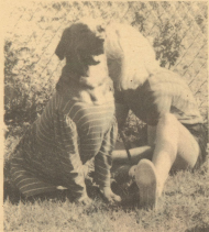
"Clementine" was the the best dressed one in the whole show.