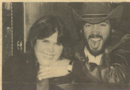
Ahhh! I guess he didn't like that question . . .