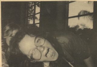
This was one girl's reaction when asked if she was going to attend the Ozzy Osborne concert in Ft. Myers. I don't think she was going.