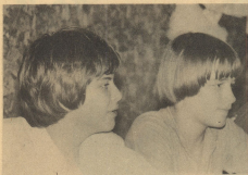
THE DUNGEON MASTER