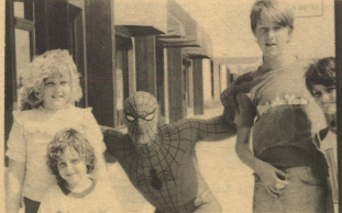
SPIDERMAN is on the alert at Naples Towne Center grand opening.