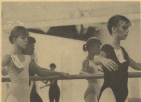
These girls are concentrating on the DC Repetory Company try-outs September 17. Singers and dancers showed their talent all day.