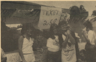
McDonald's in Golden Gate had a great carnival September 24 to benefit Big Brothers, Big Sisters of Collier County.