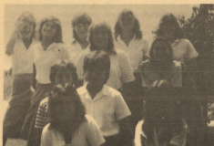
A random survey of career goals.

Have you wondered what you're going to do for a career. I asked 11 kids what they were going to do: 1 modeling, 2 work with computers, 2 nurses, 1 teacher, 1 secretary, 1 lawyer, 2 actors, and 1 wants to go into fashions.