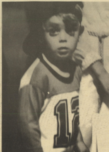
Halloween is a little confusing sometimes.

apples, hot dogs, pop corn, Madame Mystic, costume fun, more fun.