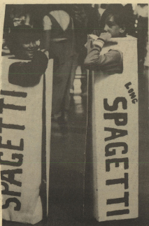
It is said you are what you eat...