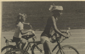
The Bike-A-Thon for St. Jude's Children's Hospital was held in October at Gulf View Middle School. Here 2 kids spend their time to help raise money for other kids less fortunate.

Let's all recycle to save energy and earn money for ourselves or to help charities.