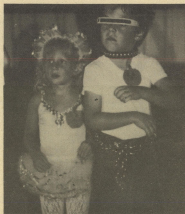
Everybody had a party. These junior gymnasts dressed up for the Gulf Coast Gymnastics halloween party.