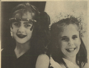
Roses are red, violets are blue...lipstick is black?