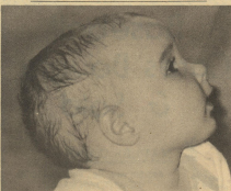
Another beautiful soul.