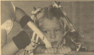
A soulful look on the little soul's face as she rests her head on someone's sole... at Naples Progressive Gymnastics Center after the Diaper Derby in November.

Although it was two years ago, it feels like yesterday. Some things never change, including the freshmen hall.