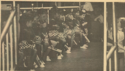
Students of the Dance Center on Davis Blvd. sang and danced to a standing room only audience