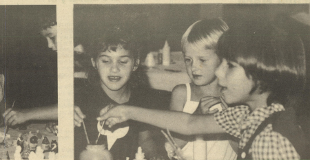
popular at Fleischmann Park in December.