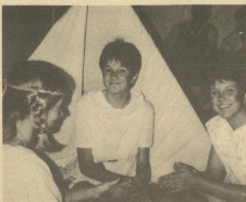
Some indians from the play "A Day in Colonial Life."