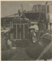
When the PAL Gators hold a car wash, even the biggles show up. How do you wash a semi? Start at the top, of course.

Pick up entry blanks at area McDonald's® Restaurants.