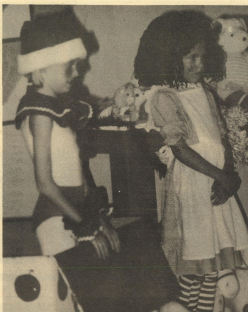
The DC Junior performed a Christmas Dance