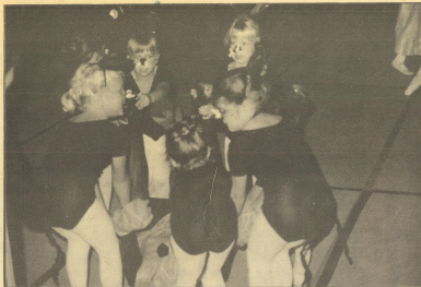
"The Nutcracker" was performed at Fleischmann Park